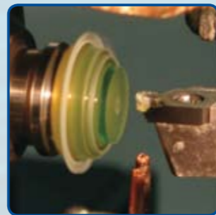
The edge is applied in a unique design to provide excellent comfort.

Hydration, surface treatment, inspection, packaging and stabilization complete the InnoLathe™ process.